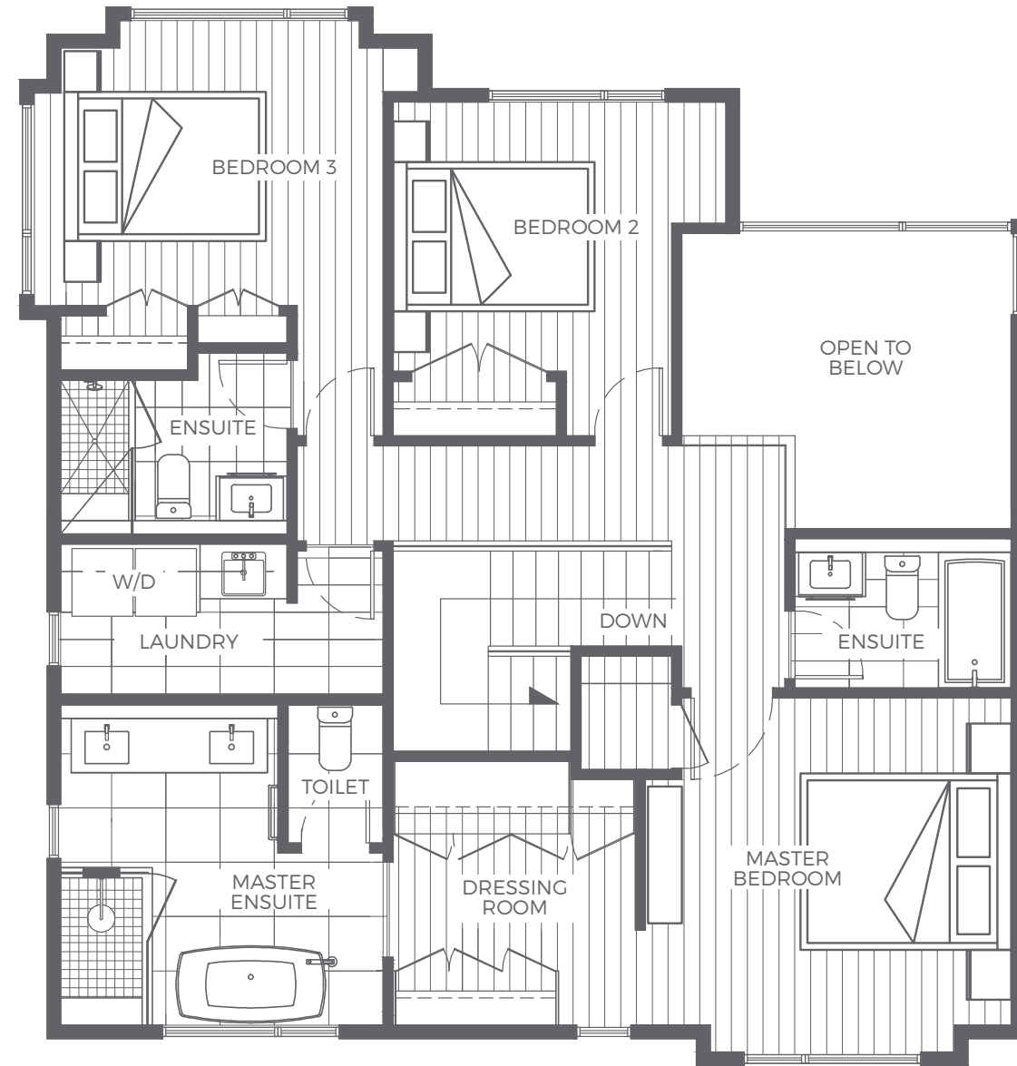
SECOND FLOOR 1,150 SQ. FT.